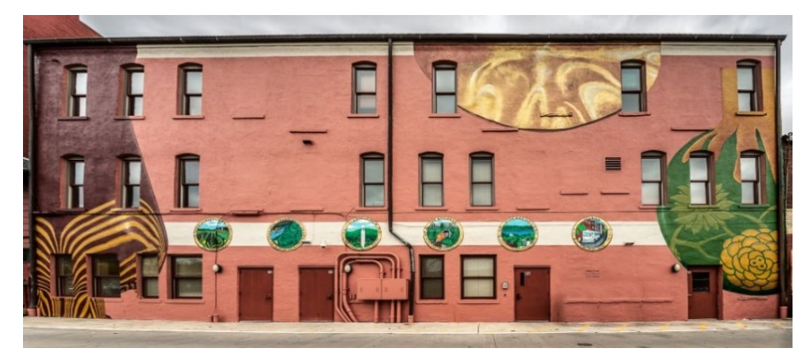
The Art of Industrious Minds , 2018 mural