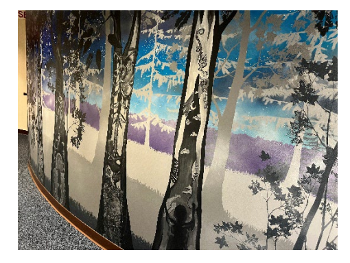
Worlds Collide, 2022 mural