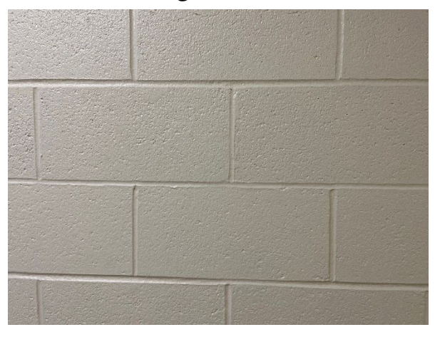
Maker Space Outside Building Image: