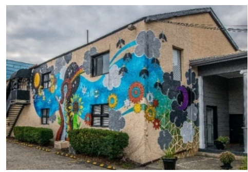
Earth Mother, 2020 mural