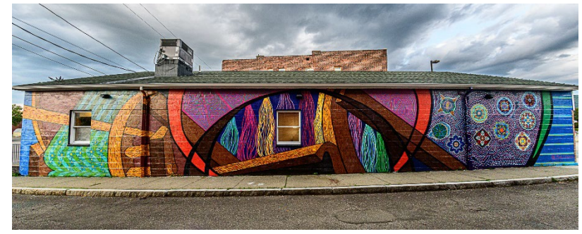
Life in a Tapestry, 2021 mural