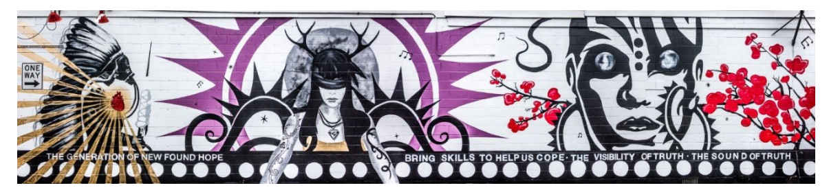
Visibility of Truth, 2016 mural